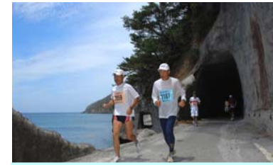
Enjoy marathon on an island