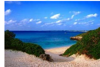
Cultivate coral reefs by using participation fees