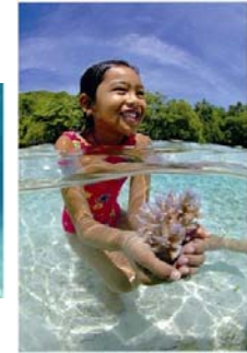
Cultivate coral reefs by using participation fees